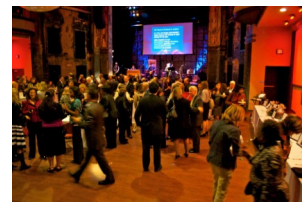
Attendees at the Queen.