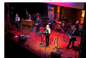
Club Phred playing (gratis) for the crowd at the Queen. They were great!